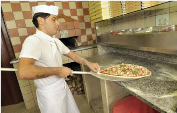
Dusty Environments Like Pizza and Bakeries