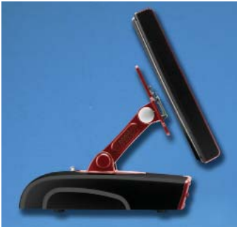
Slim Design – Small Footprint – Detachable Head for Ease of Serviceability – Color Bezel by Special Order