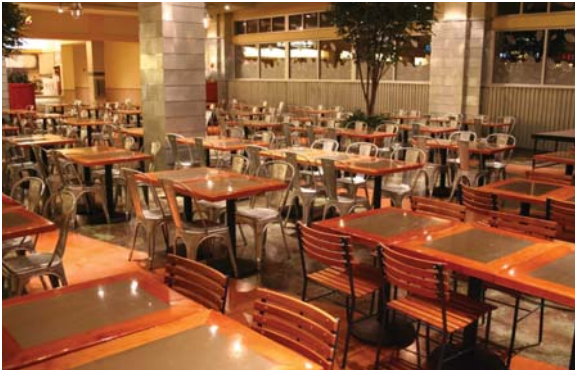
Quick Service Restaurants / Food Court Restaurants