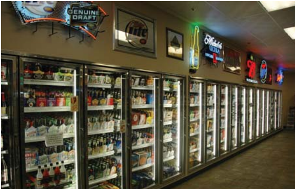
Retail Stores / Liquor Stores