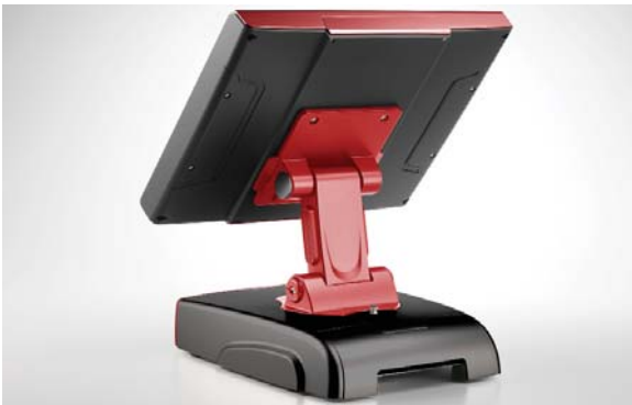
Colored Cabinets for Design Conscious Merchants