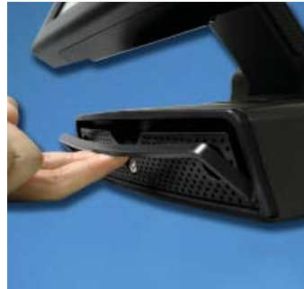
Slide-Out CPU Chassis With Snap-In Components Makes Service a Breeze