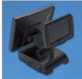
Optional Integrated 8.9" LCD Customer Display