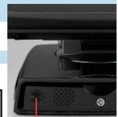
Additional USB Port on Front Standard