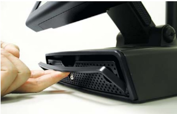
Easy Motherboard Access Facilitates Service