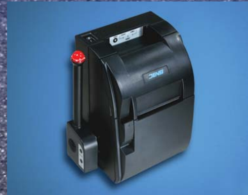
Built-In Wall Mount Bracket Optional Audio/Visual Print Messenger