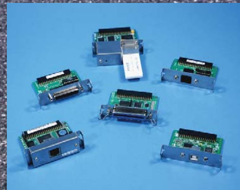
Easy to Change Interface Modules